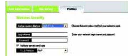
Figure 6-20: EAP-TTLS Authentication